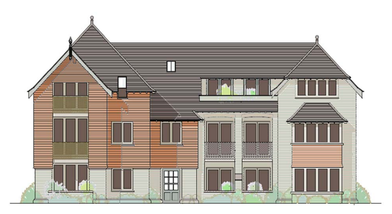
Figure 3: Proposed Front Elevation