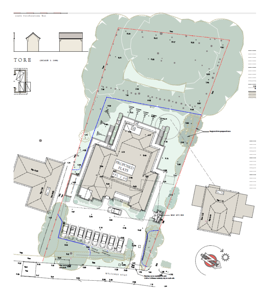
Figure 1. Proposed Site Plan

3.2 The scheme has been amended during the application process to show dimension of car parking bays, swept path and pedestrian visibility splays.