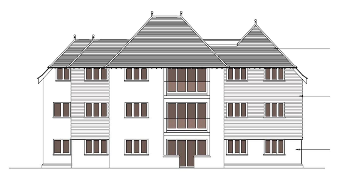
Figure 4: Proposed Rear Elevation