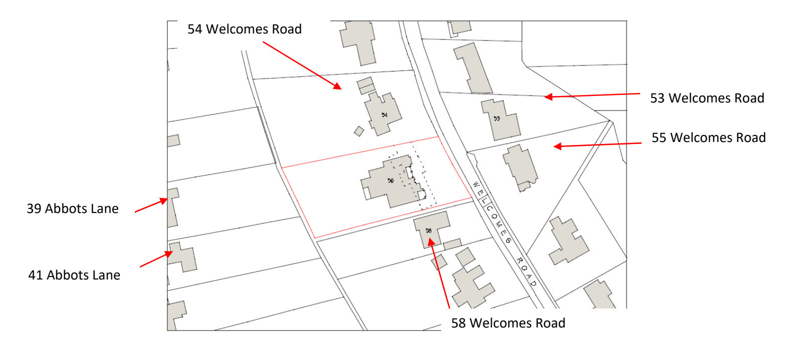
Figure 5: Proposed Block Plan

8.17 The properties that have the potential to be most affected are the adjoining occupiers at 54 and 58 Welcomes Road. 39 and 41 Abbots Lane are located to the rear and 53 and 55 Welcomes Road are located opposite on Welcomes Road. Figure 4 below indicates locations of the neighboring properties.